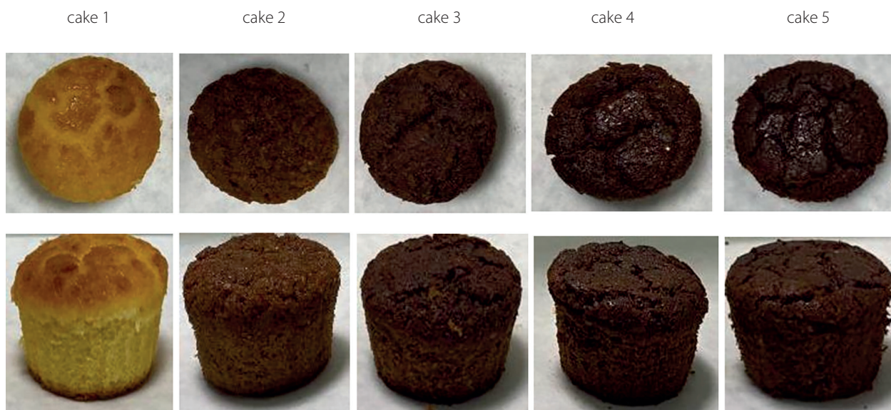
Figure 1. Appearance of corn gluten-free cakes produced without (cake 1) and with carob flour as a corn flour substitute at the weight levels of 10% (cake 2), 20% (cake 3), 30% (cake 4), and 40% (cake 5).

cakes were prepared, they were left in the container to cool for about 30 min. The production was made in duplicate. Six cakes were baked in each batch. The appearance of the gluten-free cakes is shown in Figure 1 .