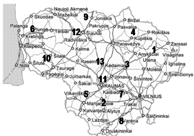
FIGURE 1. Honey sampling points in Lithuania: 1–Stirniai (Labanoras forest), 2–Birstonas, 3–Ukmerge, 4–Kupiskis, 5–Kazlu Ruda, 6–Salantai (Klaipeda region), 7–Elektrenai, 8–Matuizos (Varena region), 9–Joniskis, 10–Silale, 11–Kaunas (Vilijampole, Kleboniskis), 12–Siauliai, 13–Krakes (Kedainiai region).

The presumption can be made that such volume of Pb was found due to the locations of apiaries – the city territory (Vilijampole), suburb (Kleboniskis) or the vicinity between streets of the city and highways, whereas it is obvious that the internal-combustion engines are the main source of contamination with Pb. The minimum amounts of Pb were determined (Figure 2) in the honey collected in the eco-friendlier areas of Lithuania, in the North of the country, which is far away from highways and did not have industrial giants or thermoelectricity stations: in Joniskis ( 3.20 \mu\text{g}/\text{kg} ), in Silale and in Salantai, Klaipeda region ( 4.10 \mu\text{g}/\text{kg} ). In comparison, weekly standard of Pb per person (weight \sim 60 kg) in Germany is 1500 \mu\text{g} [Souci et al. , 1994]. If 10 kg of honey collected in Kaunas city territory which possesses the highest level of Pb, or 30 kg of honey, bearing medial concentrations of this